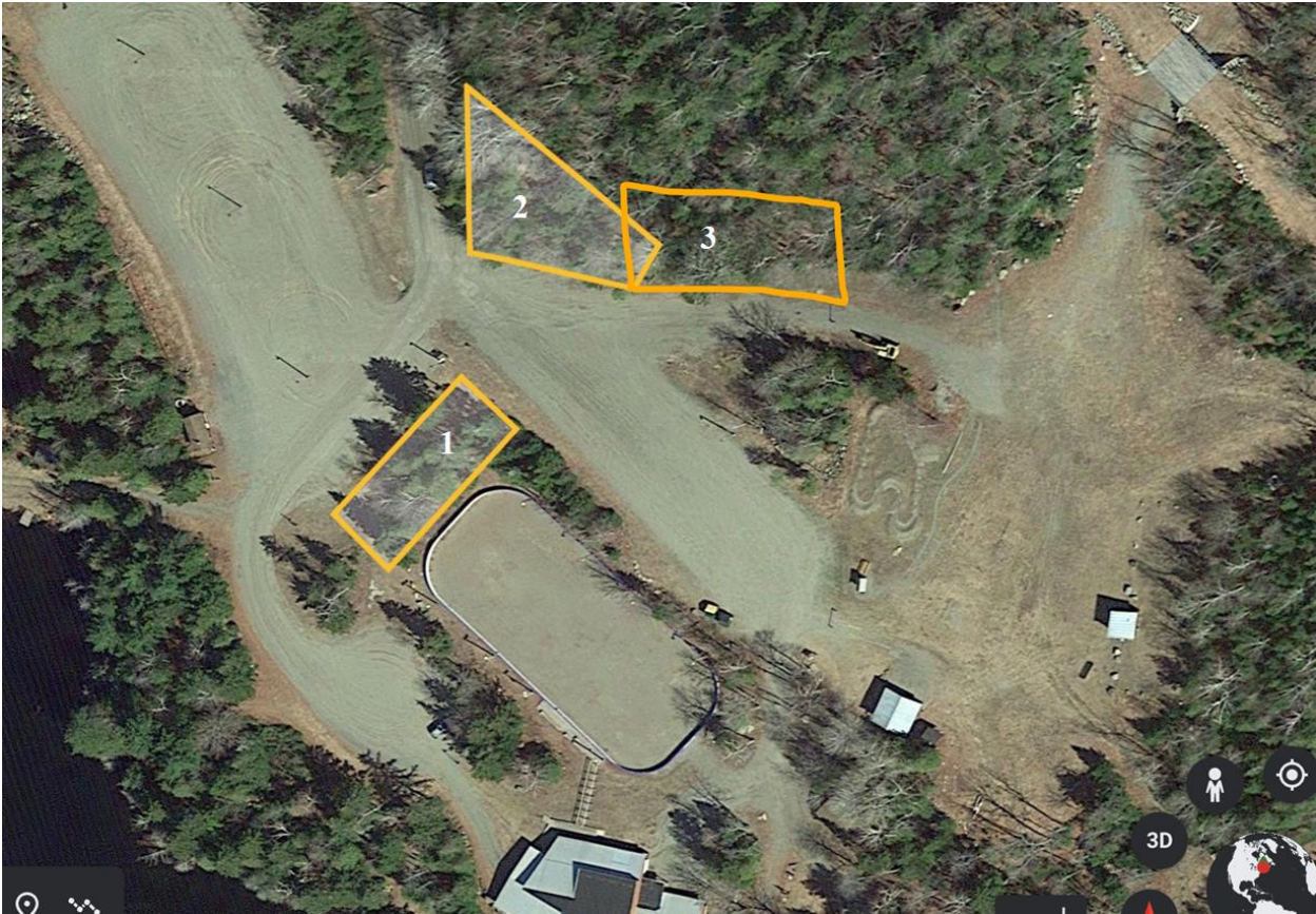
Options 1, 2, and 3 at the Outdoor Center