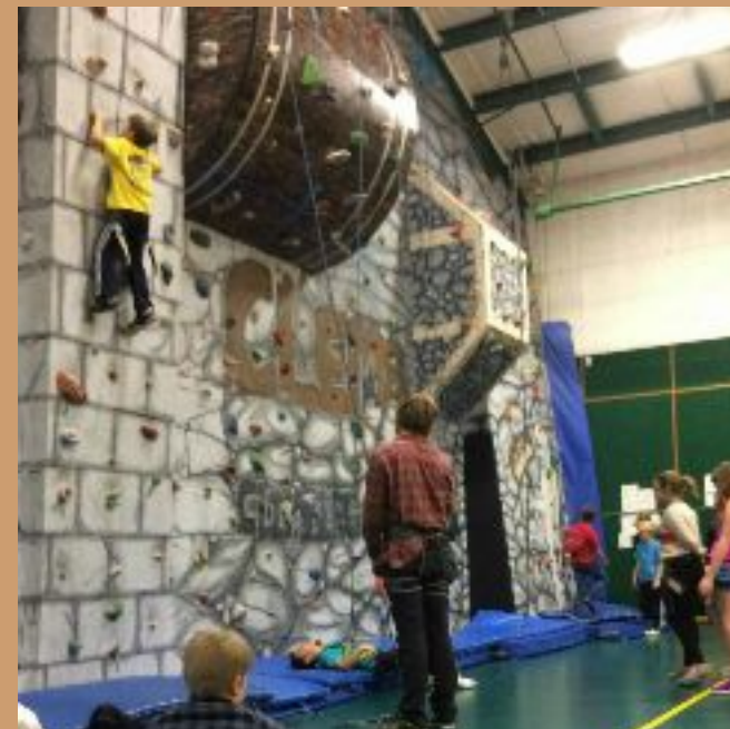
35-Foot Climbing Wall